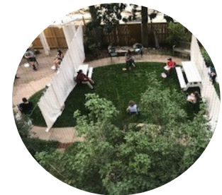
Pictured: Socially distanced outdoor summer grief groups

We witnessed first-hand the strength and resilience of our community; uniting in the face of adversity to help us fulfill our mission to support those grieving in a socially distant and uncertain world. There is more work to be done, and we thank you for supporting the families we serve on their grief journeys.